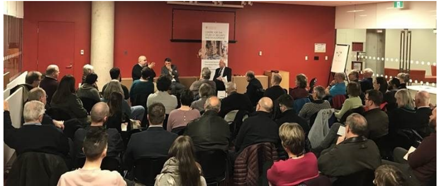
Crowd shot at Turkey panel event at the Halifax Public Library, March 2018

grateful for practical and sometimes financial support from the Political Science and International Development Studies departments, the Jean Monnet European Union Centre of Excellence, the MacEachen Institute for Public Policy and Governance, the Schulich School of Law, and the Halifax branch of the Canadian International Council.