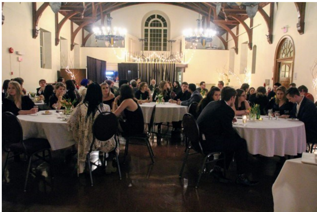
Crowd shot from the tour de force , the Political Science Gala and Journal Launch.