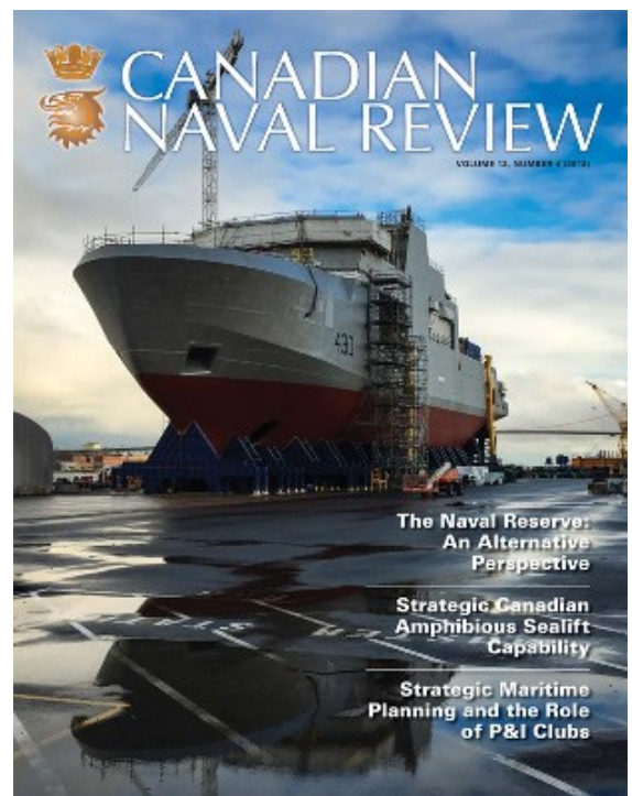
CNR latest edition (Vol. 13 Number 4)