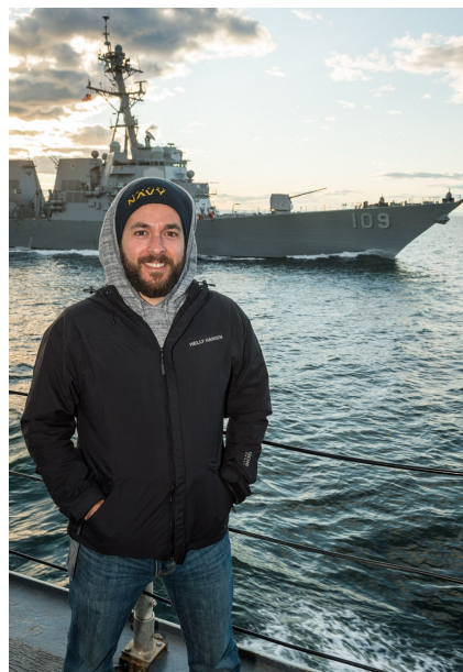
On board HMCS Toronto (USS Jason Dunham in the background)