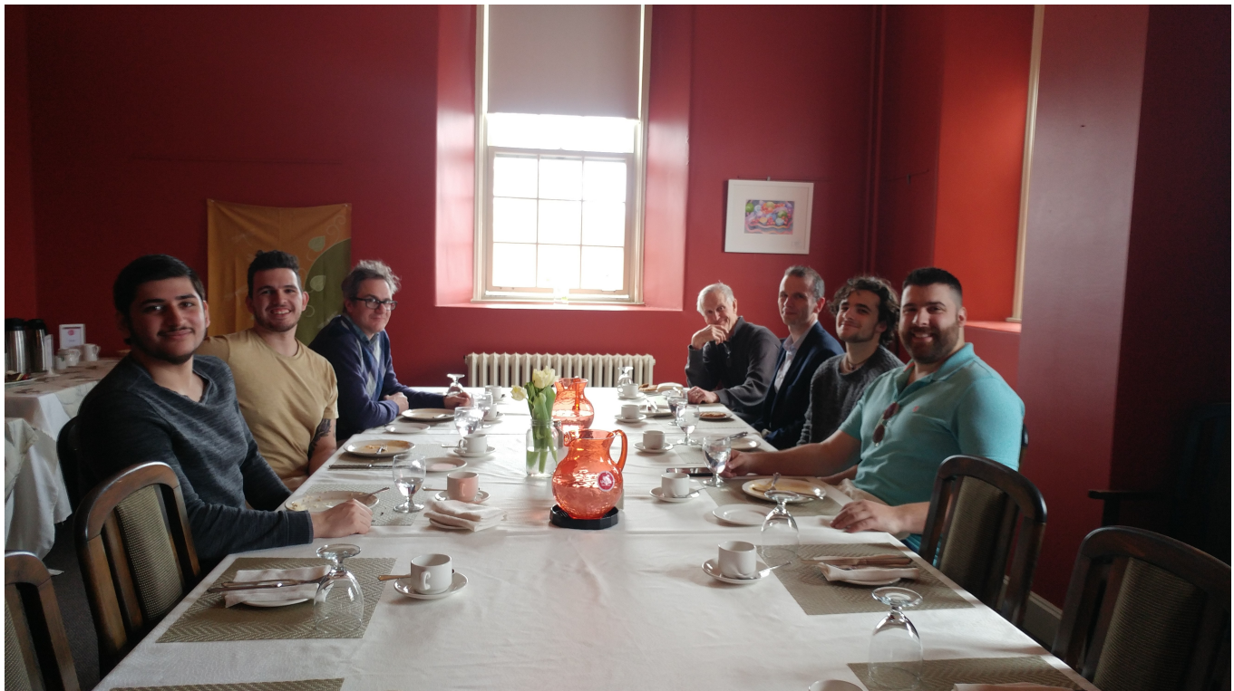
Honours luncheon hosted by the Department of Political Science with funding support from the Faculty of Arts and Social Sciences and Poli Alumni.